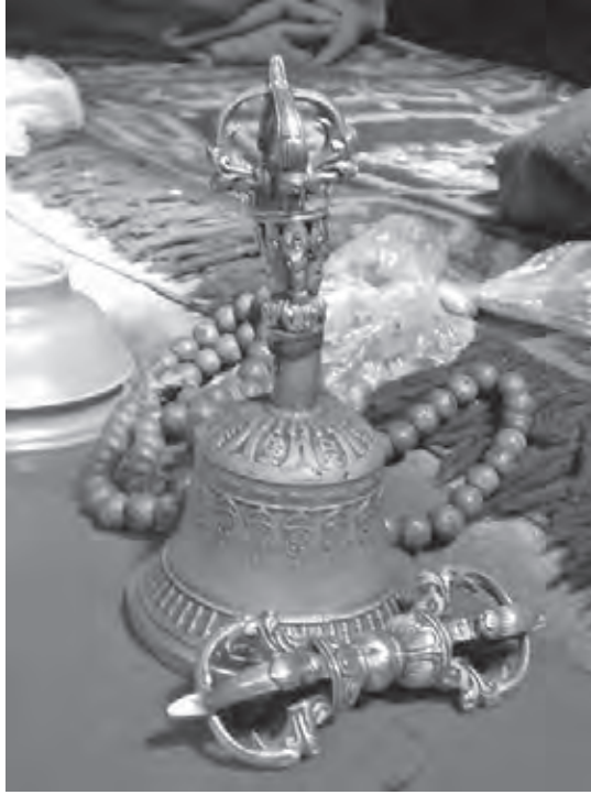
Three Vajrayana Ritual Implements: Vajra, Rosary, and Bell

part of the religion of that ancient culture. The deity Shiva, being the husband of Shakti, the Shaiva, and Shakta traditions share many things in common, including a deeply tantric sensibility. In addition to the Shakta traditions, the Kashmiri Shaiva tradition, too, could be considered a purely tantric system of thought and practice, systematised by the Shaiva philosopher,