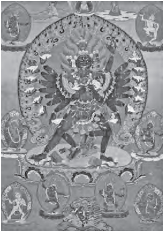
Hevajra and Nairatmya, Surrounded by a Retinue of Eight Dakinis in the Tantric Practices of the Shakya School of Tibetan Buddhism.

Among these traditions, Buddhism was probably the most transformed through its