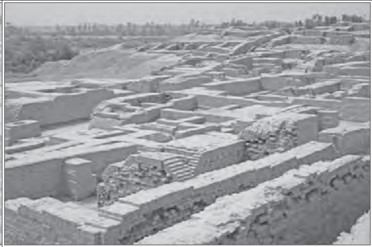
Indus Valley Civilisation