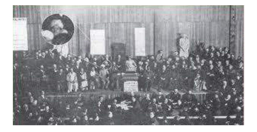
A Rare image of Swami Vivekananda at the Parliament of Religions, Chicago

This short speech recreated an interest about India in the west, in the 20<sup>th</sup>century.