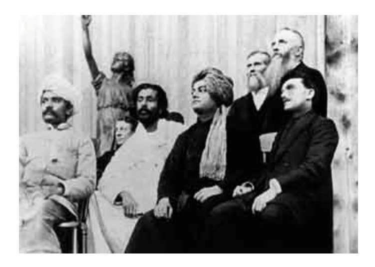
Swami Vivekananda at the Parliament of Religions, Chicago, 1893