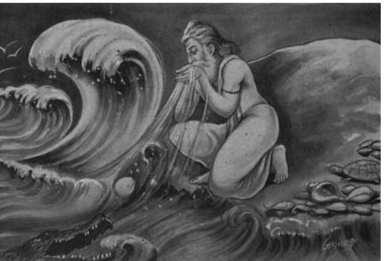
Sage Agastya Drinking the Ocean

The Vedic period is uniformly considered to be more kind to women and affording equal opportunities for their creative expressions. Thus it is natural to find the mention of at least twentyseven Vedic riṣikās in the Rig Veda and the hymns of some of them like Ghoṣā have come