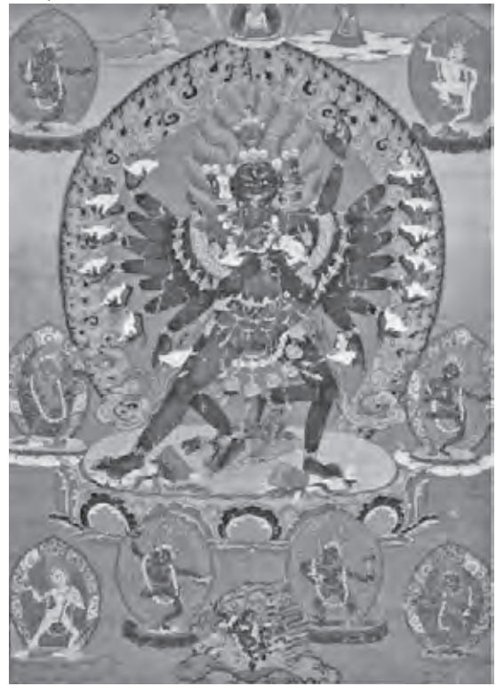
Hevajra and Nairatmya, Surrounded by a Retinue of Eight Dakinis in the Tantric Practices of the Shakya School of Tibetan Buddhism.

transcending the senses not by the shutting out or denial of the senses, but by means of the senses. Unlike the yogic style of practice, which sees the desires evoked by sensory objects as obstacles to be overcome, tantra sees these desires as energies that can be redirected productively towards the aim of spiritual liberation.