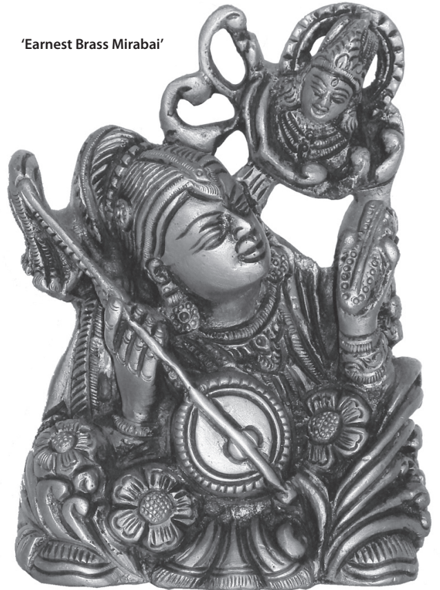
'Earnest Brass Mirabai'

Karaikkal Ammaiyar, literally 'the saintly mother of Karaikkal', of the seventh century, is one of the sixty-three great Nayanmar saints of Tamil Nadu. She is the first saint poetess of India. In one of her songs, Karaikkal Ammaiyar describes herself as a pey , ghost, who dances in the company of Shiva, in the cremation grounds of Tiruvalankadu: