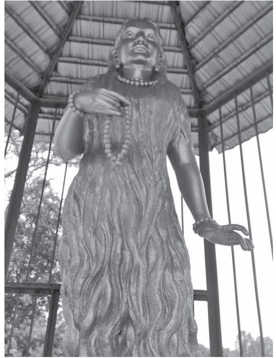
Statue of Akka Mahadevi at her birthplace, Udathadi

With a rope of untwisted thread am I towing a boat upon the ocean, Where will my God hear? Will He carry me over? Like water in goblets of unbaked clay, do I slowly waste away My soul is in a dizzy whirl. Fain would I reach my home?