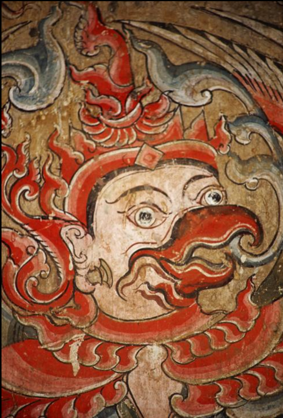
25 Garuda, Mural, Ananda Ok Temple, Bagan, Myanmar