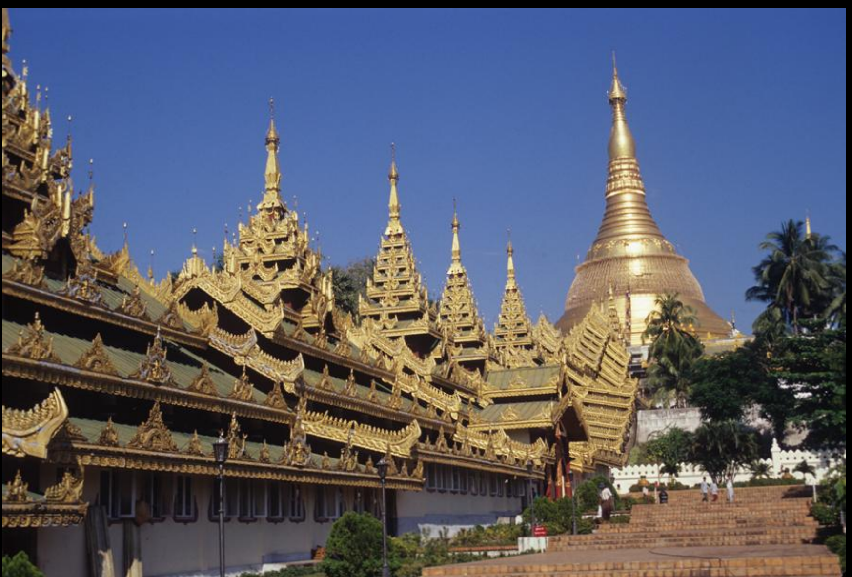
29 Shwedagon Pagoda, Yangon, Myanmar. Tradition ascribes this stupa to the 5th century BC. Archaeologists date it between the 6th and 10th centuries AD. In its size and grandeur, it brings before us the majesty of the spirit.