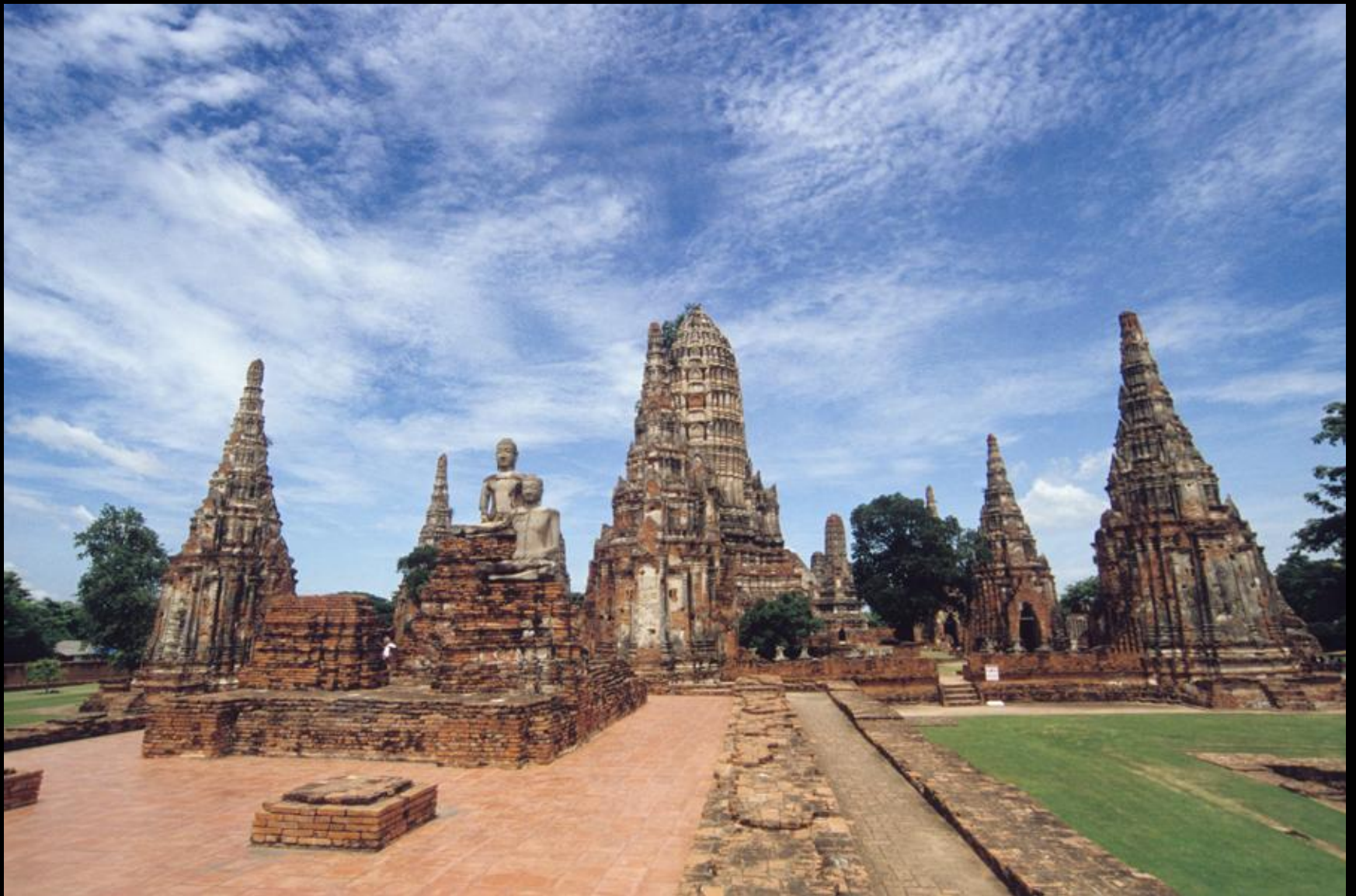
19 The majestic Wat Chawattanaram, 17th century, Ayutthaya, Thailand