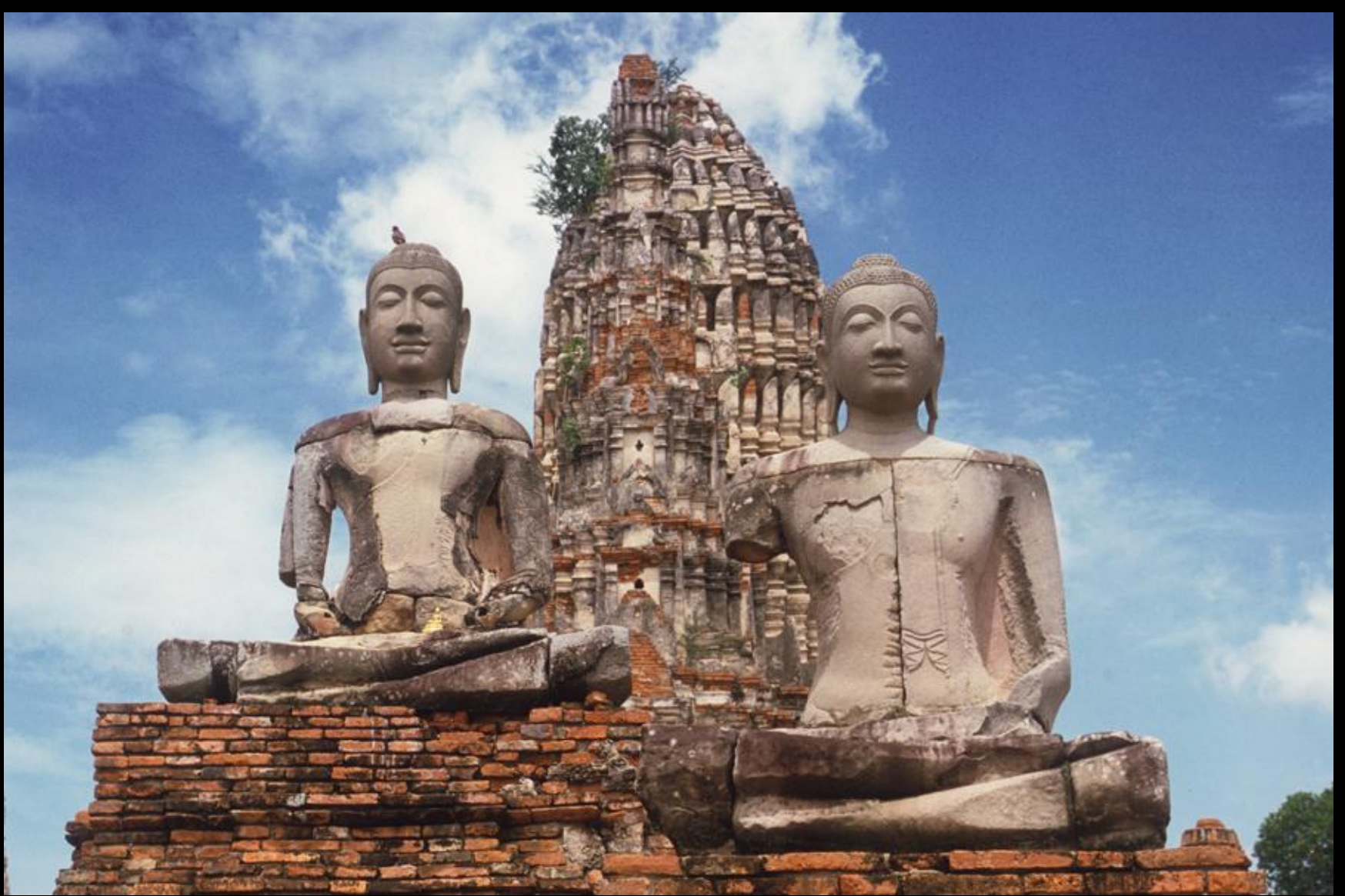
20 Seated Buddhas, Wat Chawattanaram, 17th century, Ayutthaya, Thailand