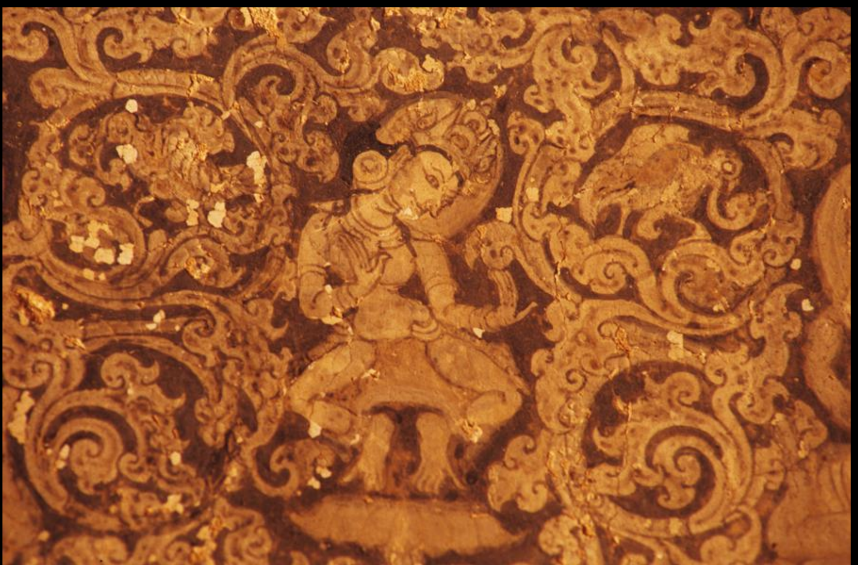
28 Exquisite murals, which are very similar to the Indian traditions of that period in Eastern India and Tamil Nadu, are found in the 12th century pagodas of Bagan. Wet Kyi Inn Gu Byauk Kyi Pagoda, Myanmar