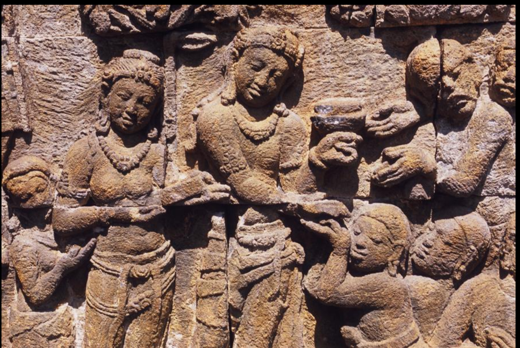
06 Scene from the Lalitvistara, 8th-9th century relief, Borobudur Stupa, Indonesia