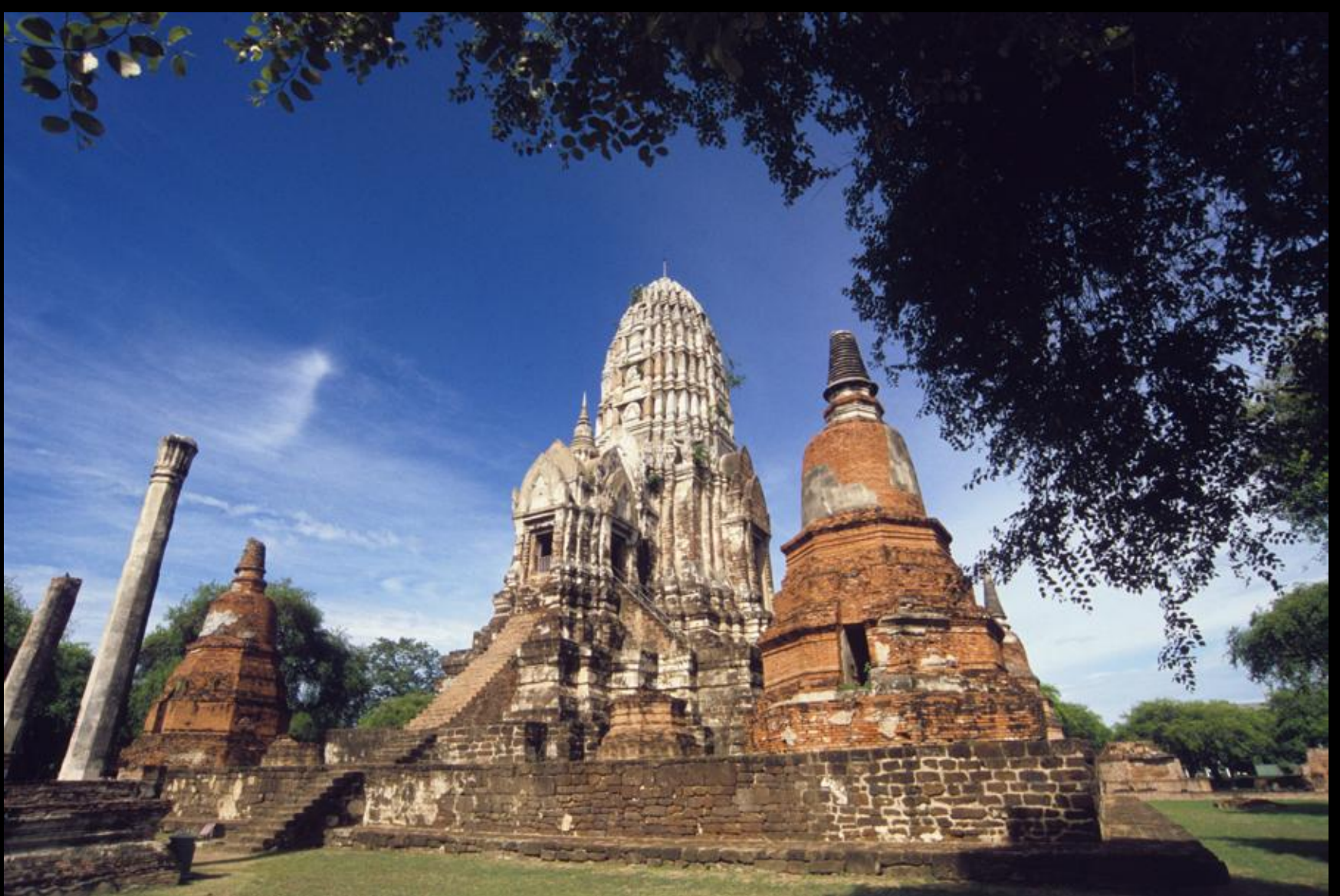
16 Wihan Luang, Wat Ratcha Burana, 15th century, Ayutthaya, Thailand