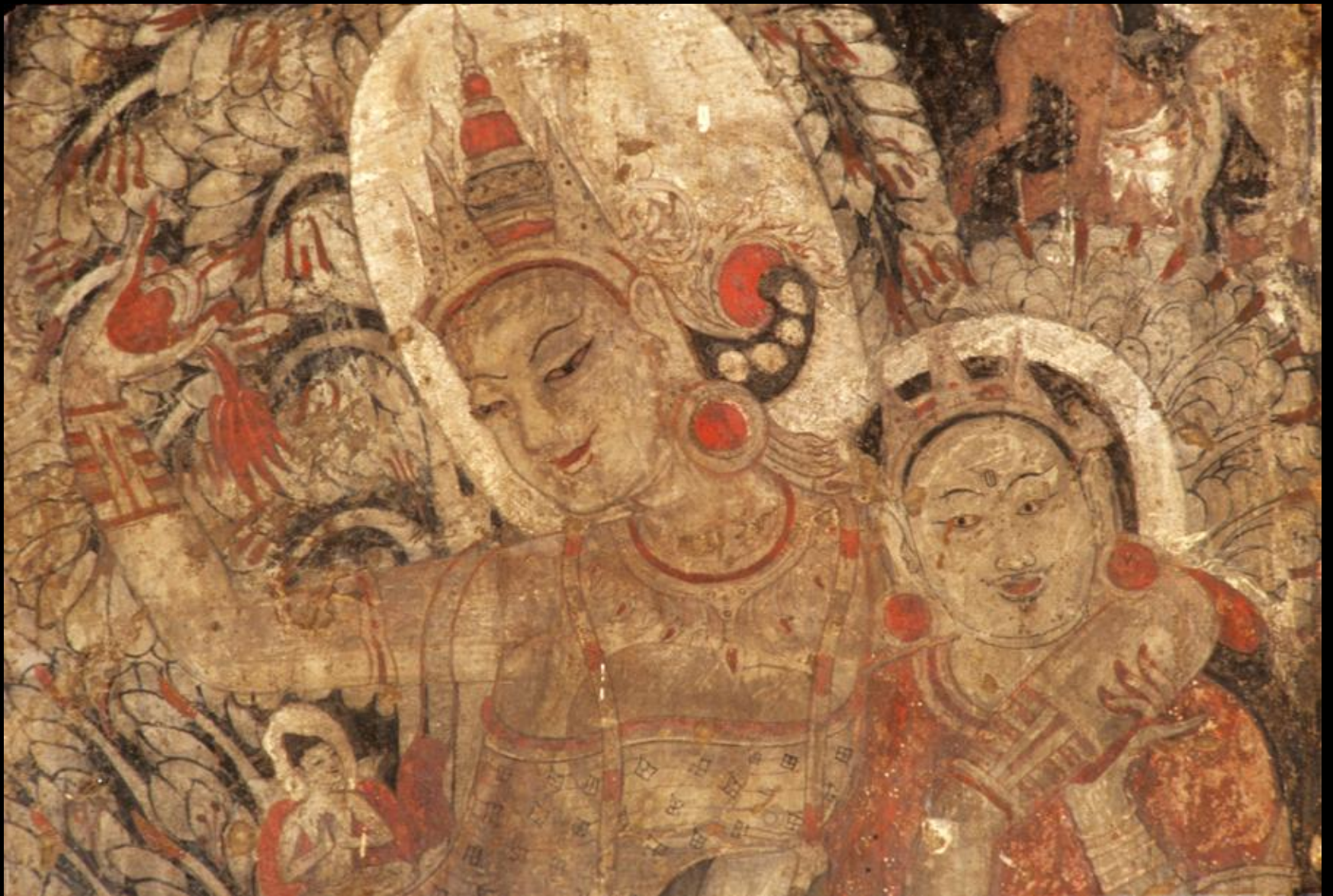
27 Birth of the Buddha, Mural, Loka Hteik Pann Pagoda, 12th cent., Bagan, Myanmar