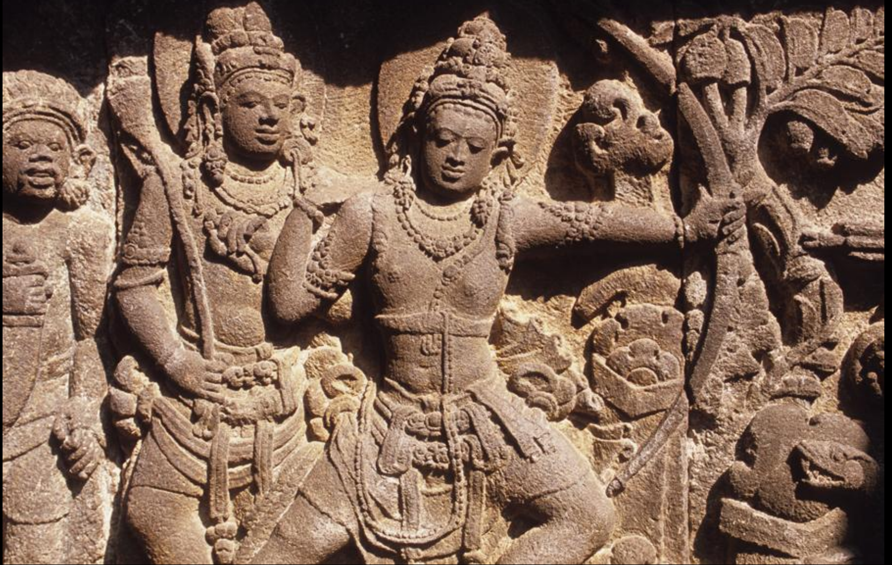
10 Rama, 9th century relief, Prambanan Shiva Temple, originally made in the 9th century, Yogyakarta, Java, Indonesia.