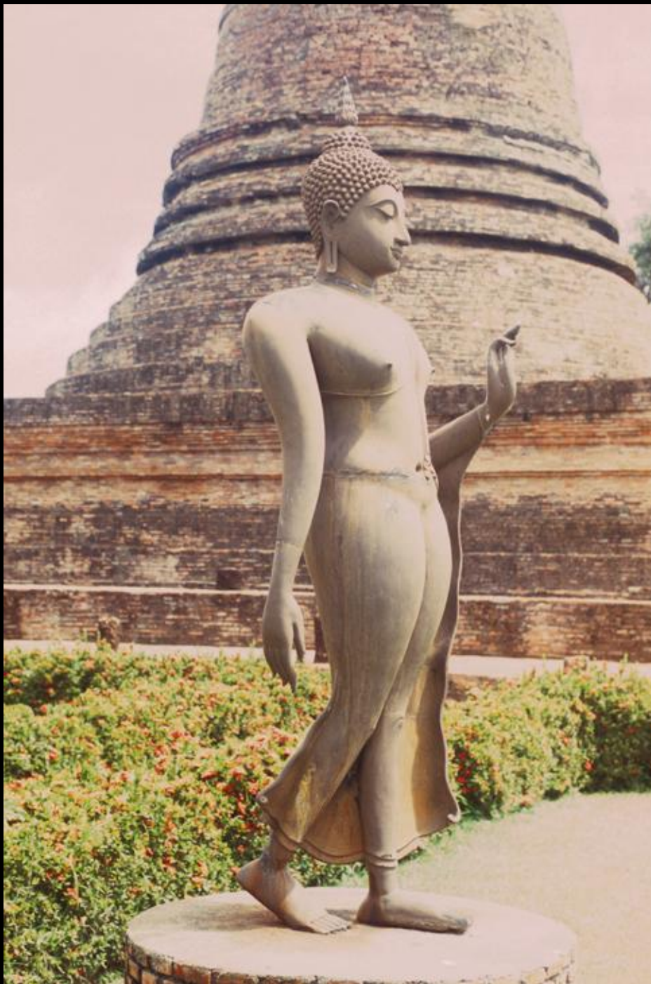
14 Standing Buddha in the exquisite Sukhothai style, Sukhothai Historical Park, 13th-14th centuries, Thailand