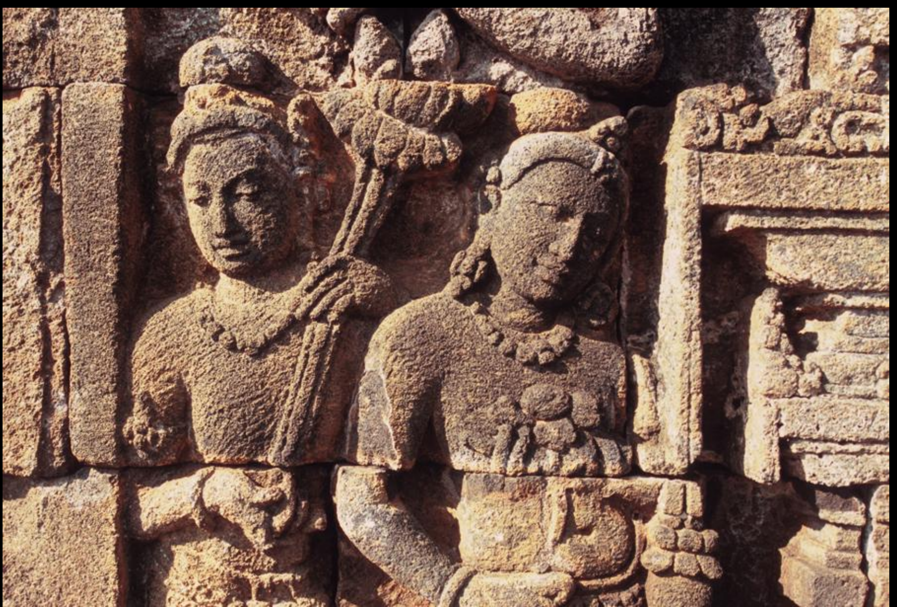
08 Scene from the Lalitvistara, 8th-9th century relief, Borobudur Stupa, Indonesia