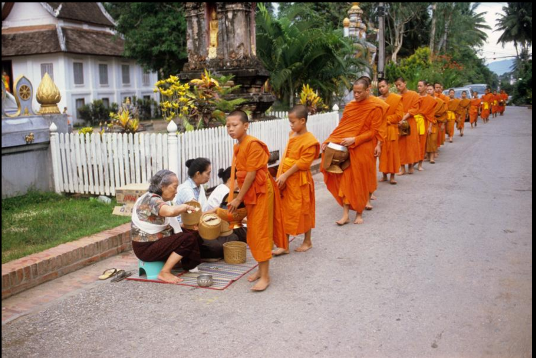
33 The people of Laos continue the tradition of alms giving. Every morning, hundreds of monks come out of their monasteries and receive the respectful donations of the people. Luang Prabang, Laos.