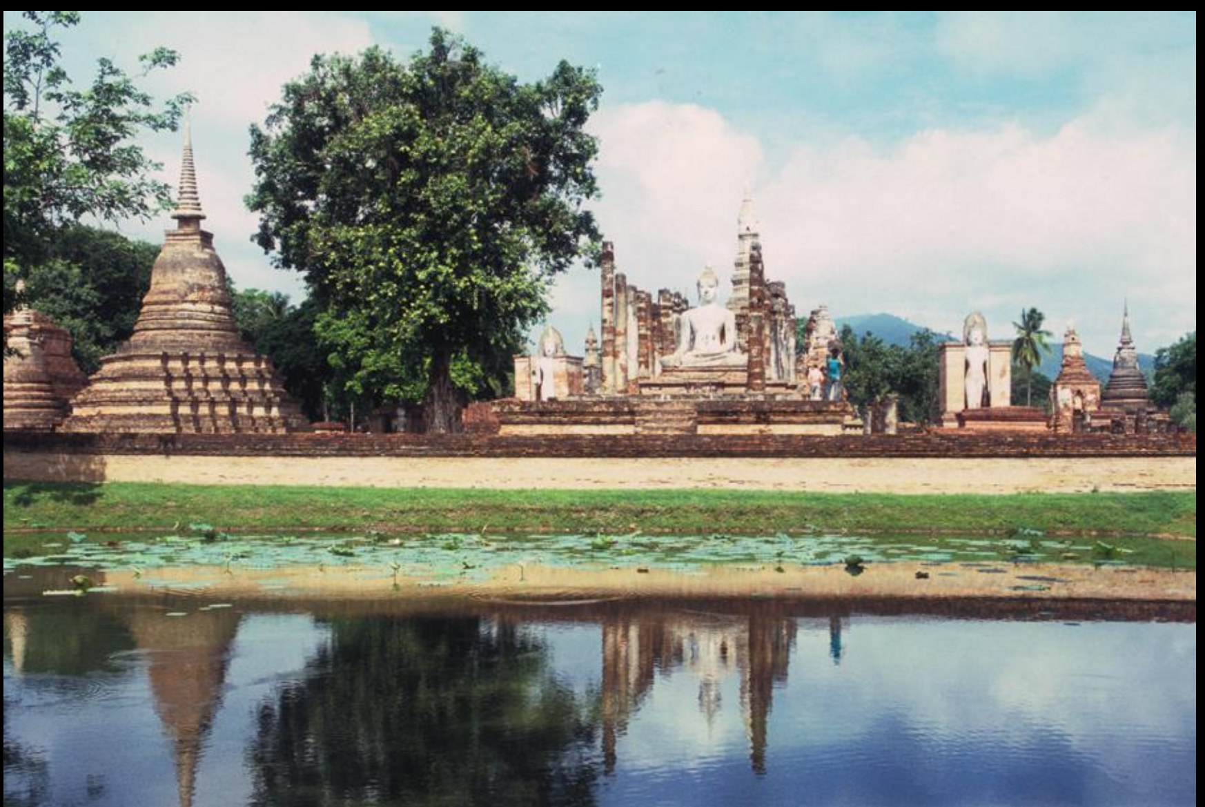
11 Wat Maha That Sukhothai Historical Park, 13th-14th centuries, Thailand