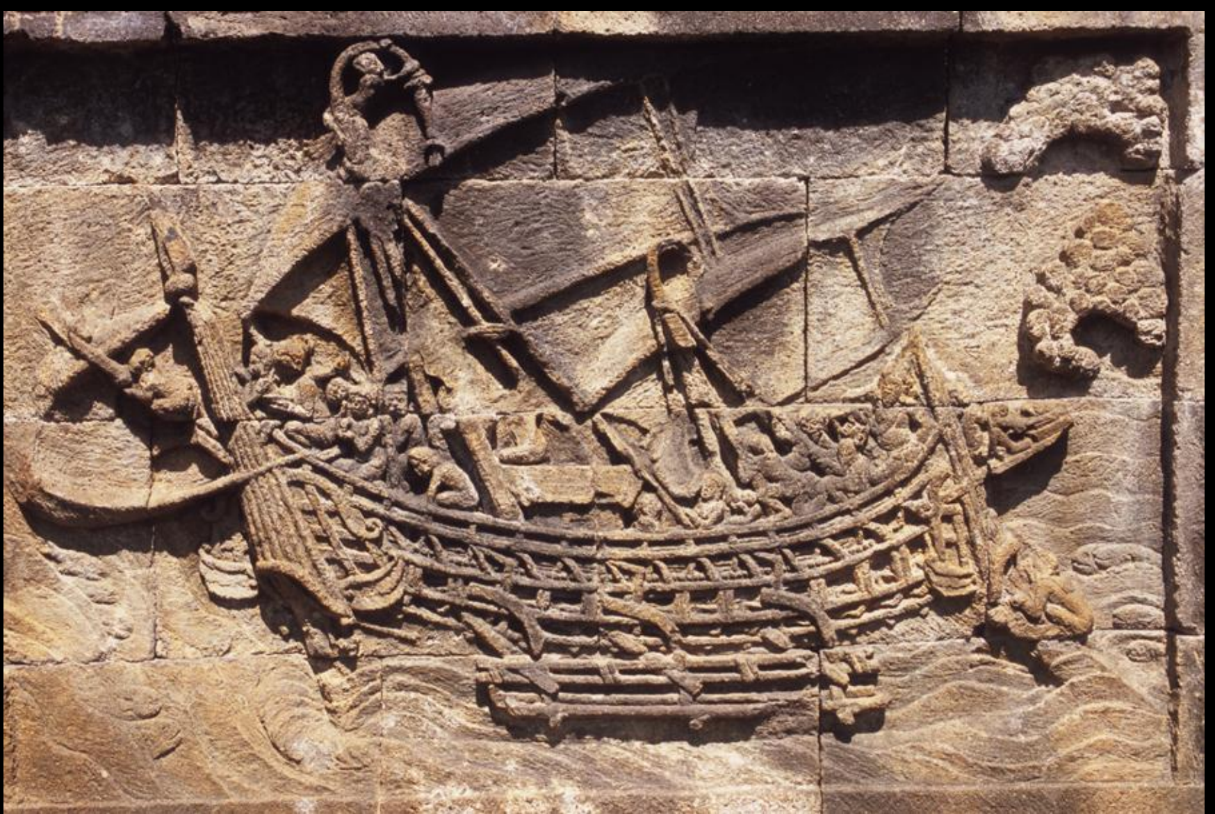
05 Depiction of sophisticated sea-going sailing ship, 8th-9th century relief, Borobudur Stupa, Indonesia.