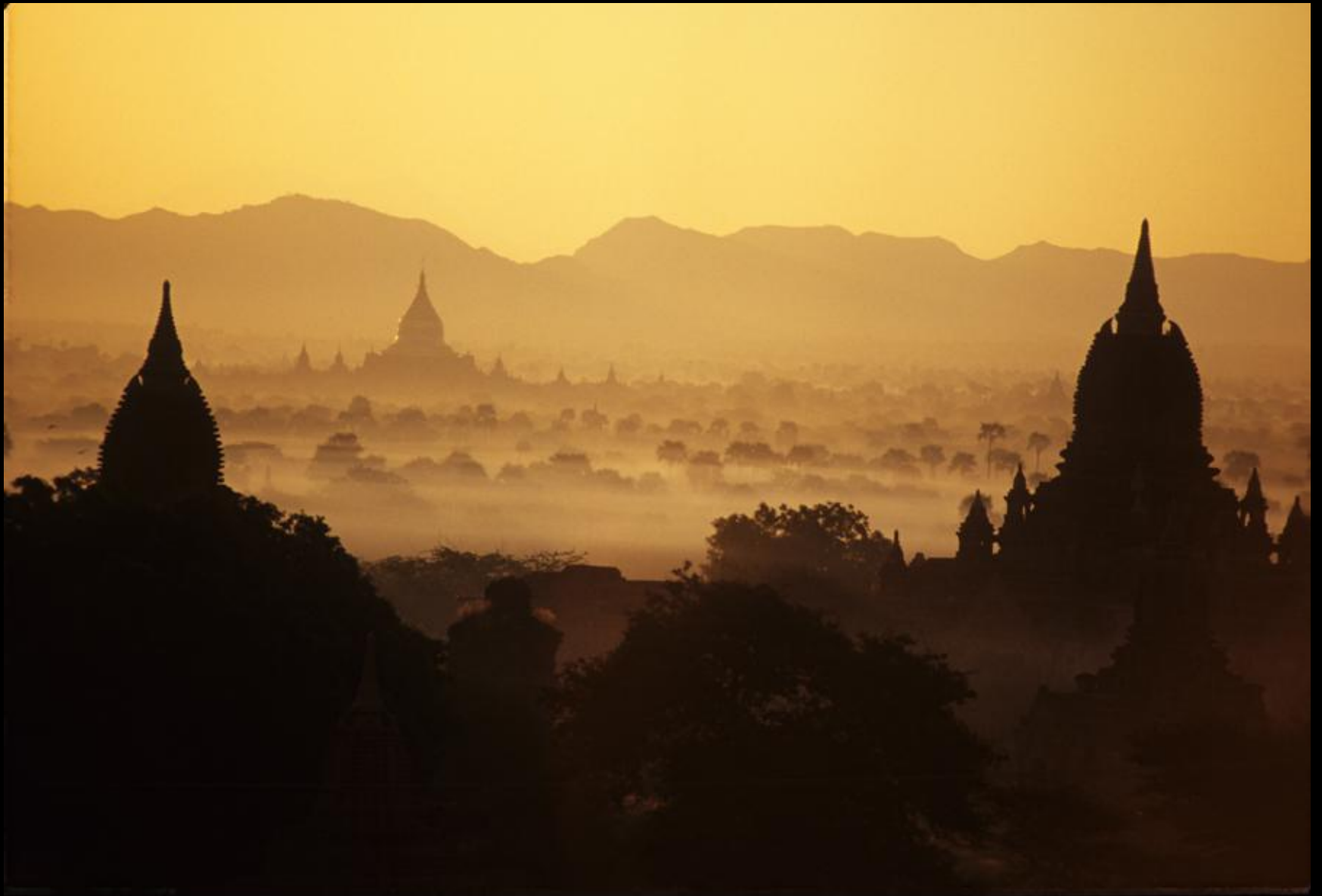
23 Pagodas at sunrise, Bagan, Myanmar