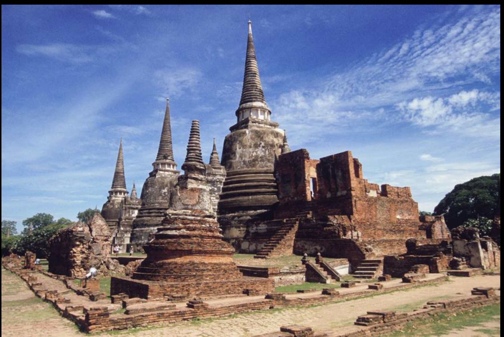
21 Wat Phra Si Sanphet, made on a former palace site, 15th century, Ayutthaya, Thailand