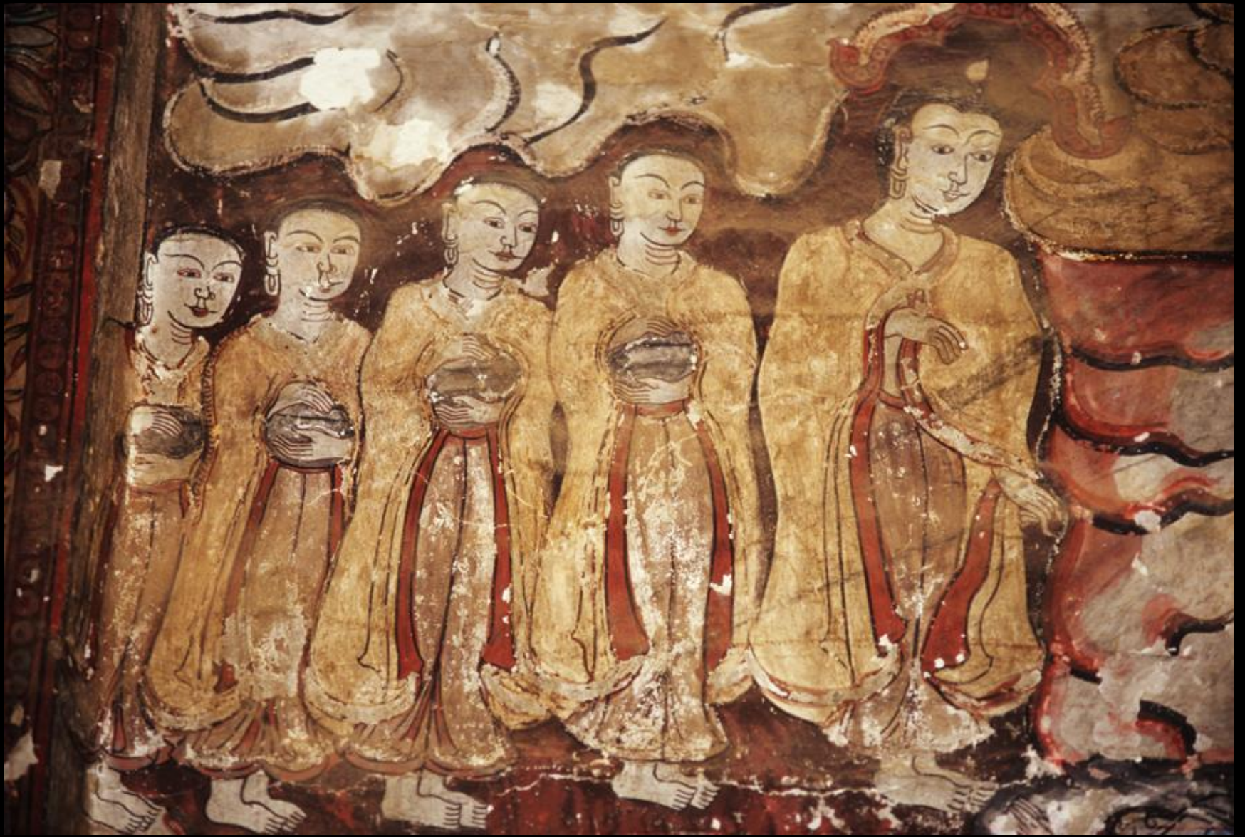
24 Mural, Ananda Ok Temple, Bagan, Myanmar