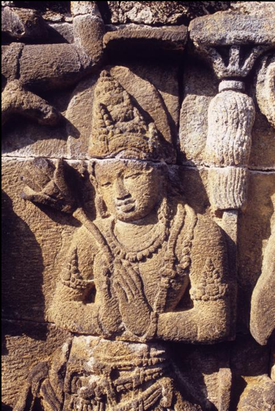
07 Bodhisattava, 8th- 9th century relief, Borobudur Stupa, Indonesia