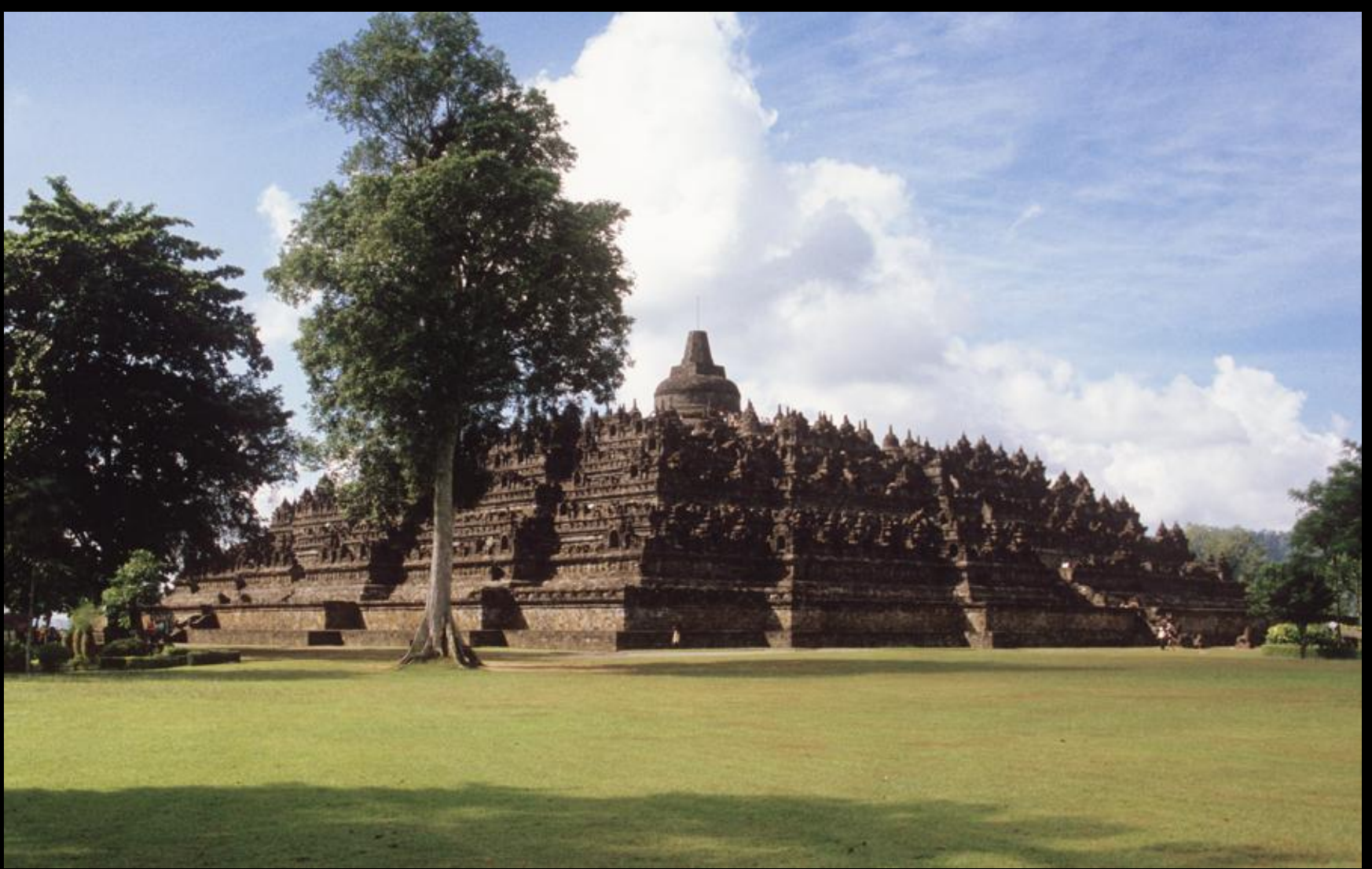
03 Borobudur Stupa, 8th-9th century AD, Java, Indonesia.