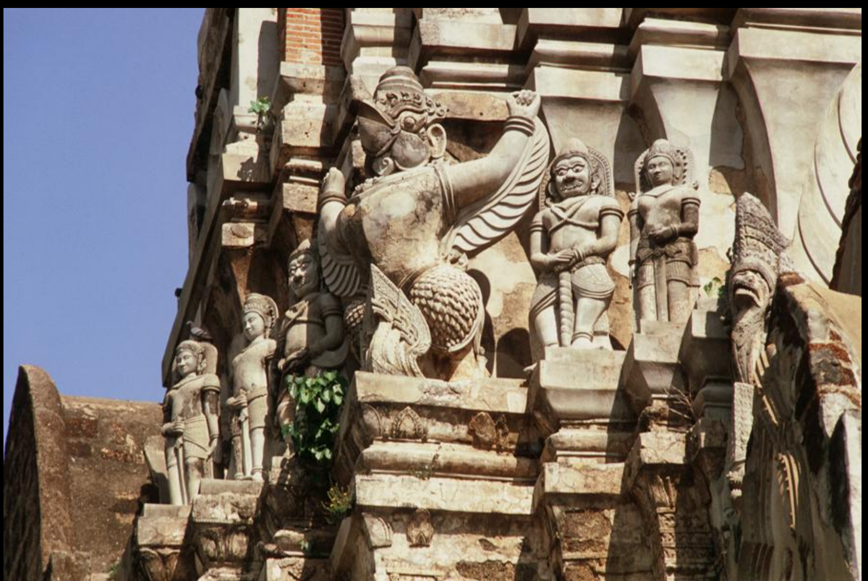
18 Garuda, the vahana of Vishnu, a royal emblem of Thailand. Wihan Luang, Wat Ratcha Burana, 15th century Ayutthaya, Thailand