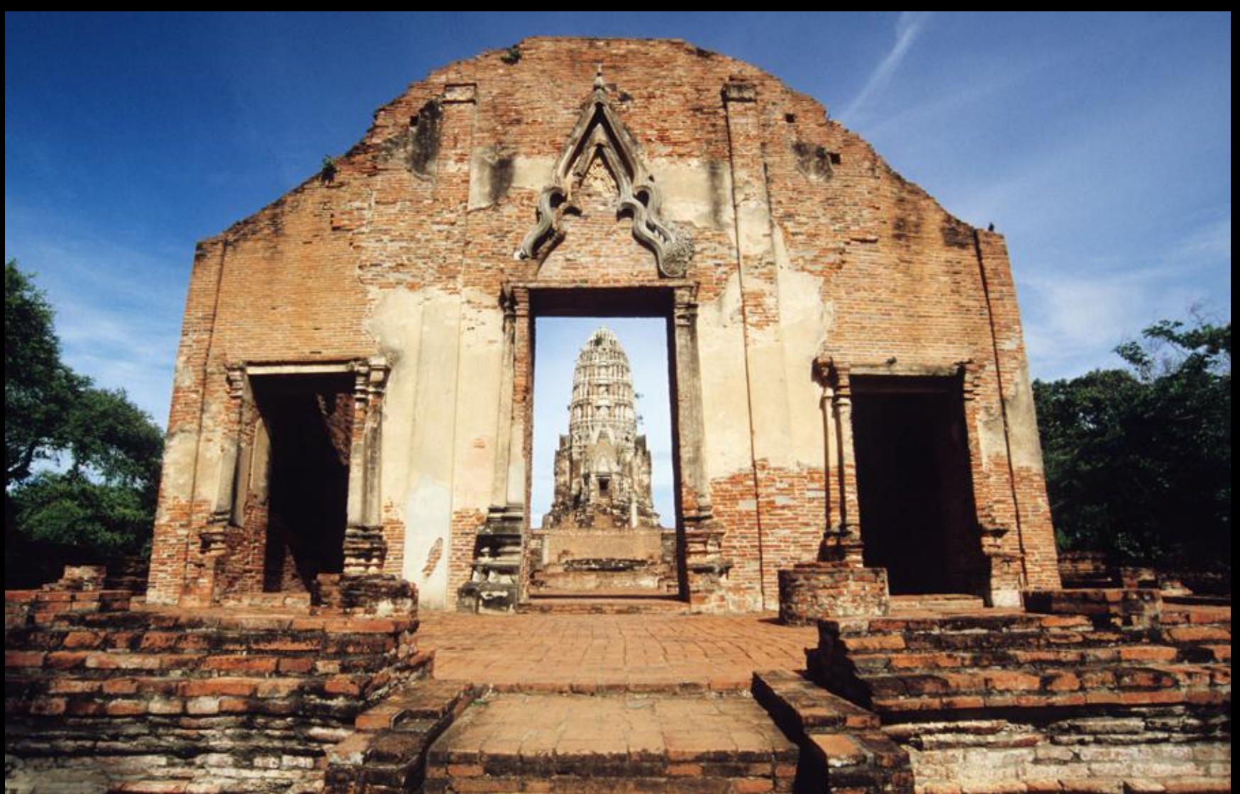
17 Wihan Luang, Wat Ratcha Burana, 15th century, Ayutthaya, Thailand