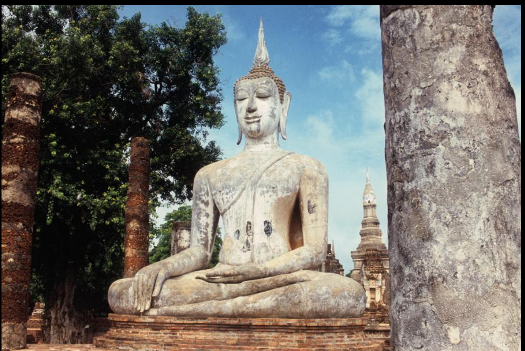
13 Seated Buddha, Wat Maha That, Sukhothai Historical Park, 13th-14th centuries, Thailand