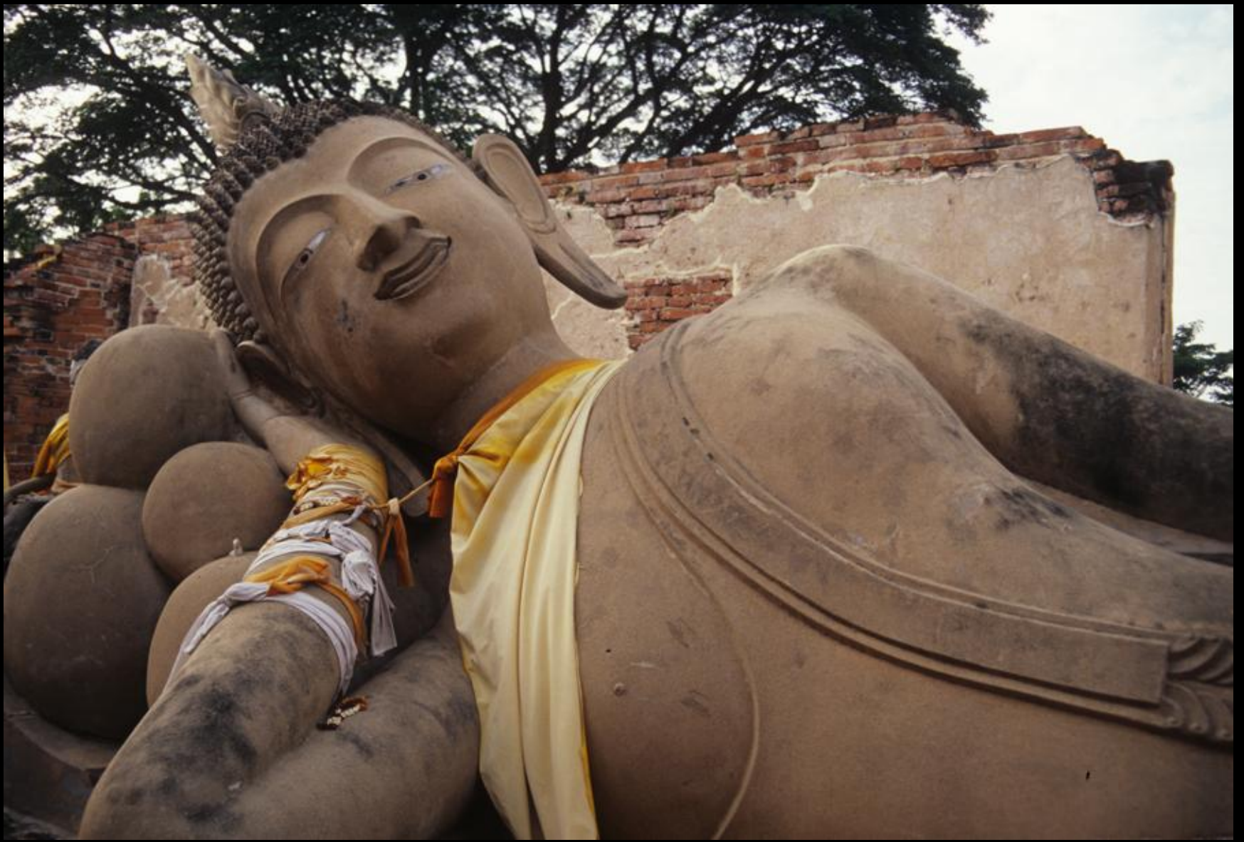
22 Parinirvana, Ayutthaya, Thailand