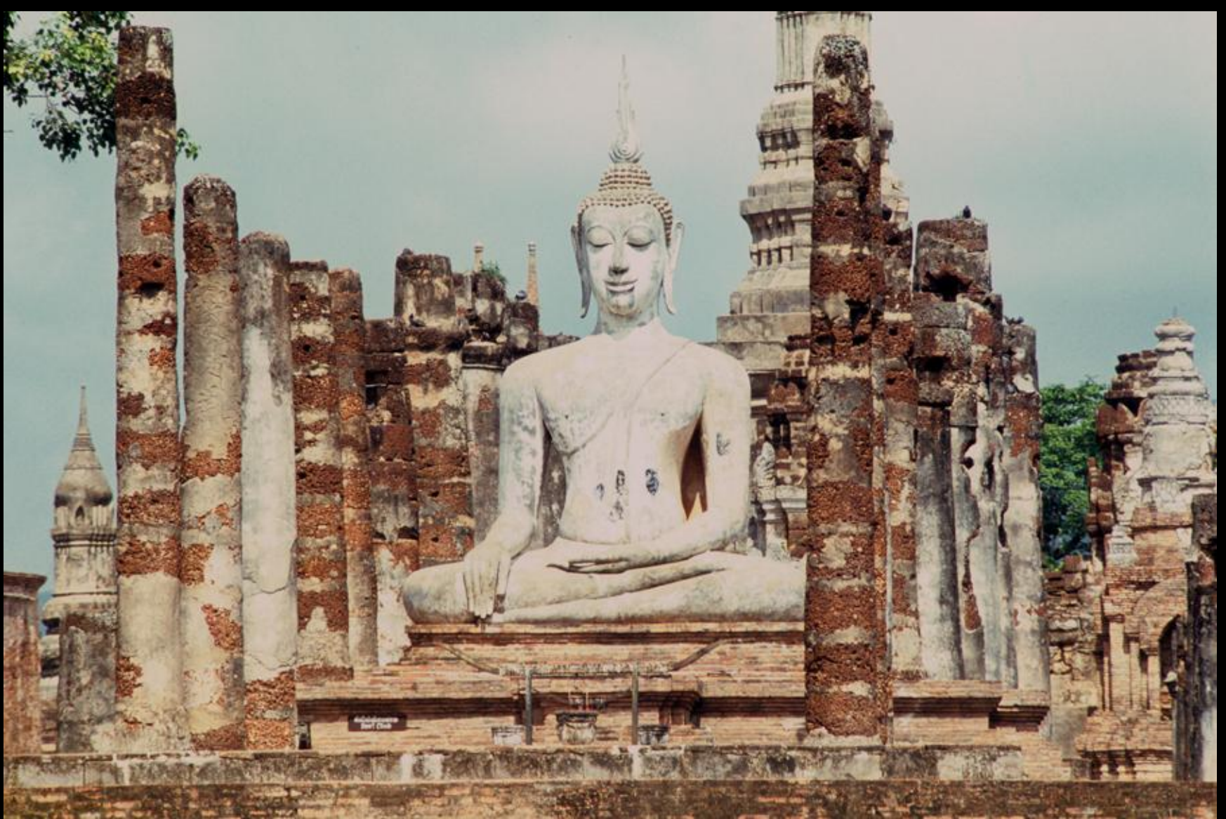
12 Seated Buddha, Wat Maha That Sukhothai Historical Park, 13th-14th centuries, Thailand