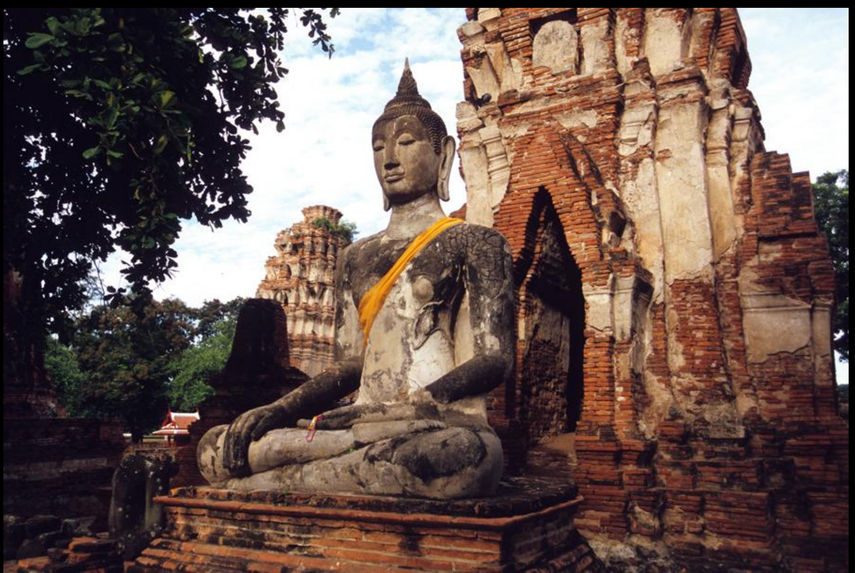
15 Wat Maha That, end-14th century, Ayutthaya, Thailand