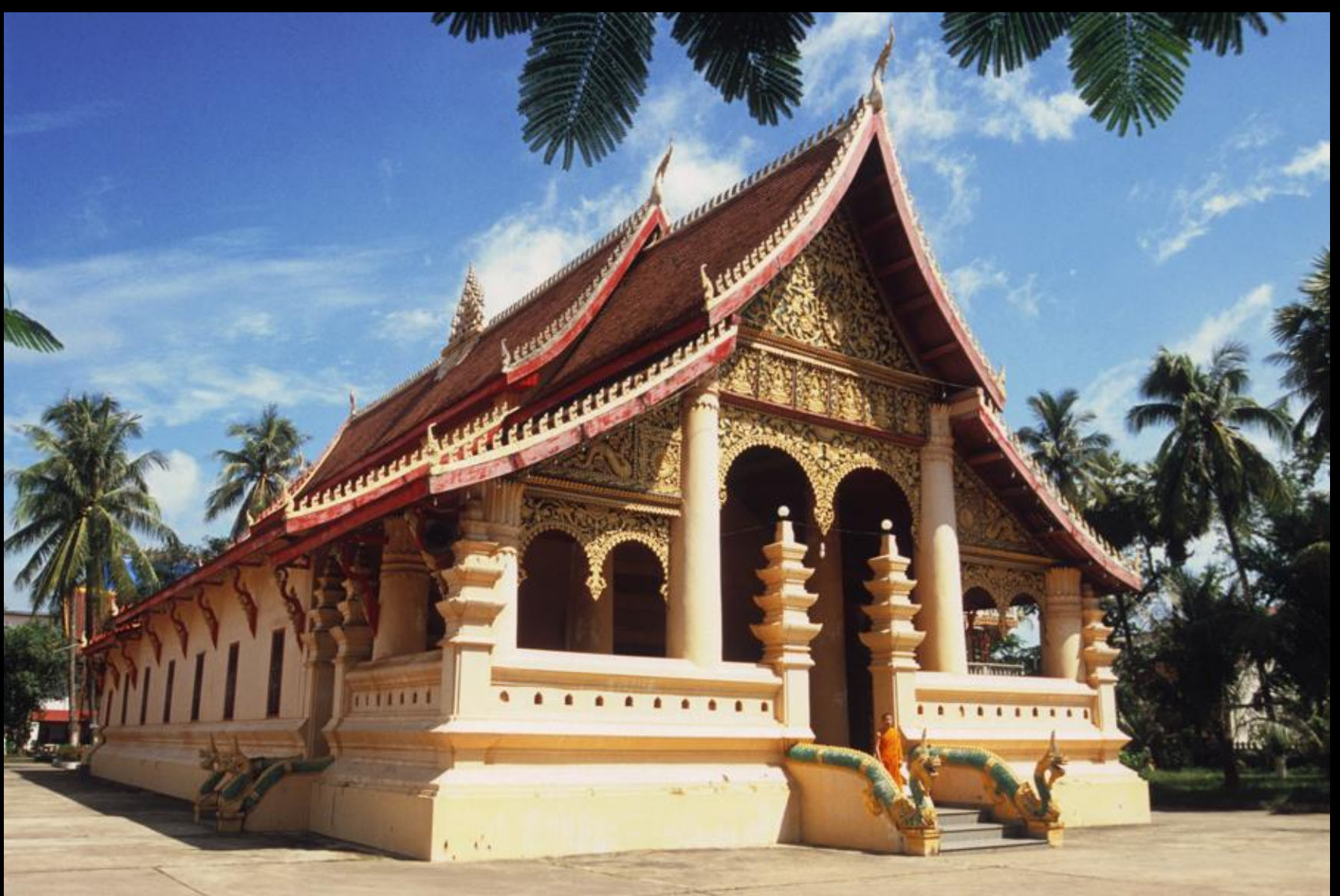
31 Ongtue Temple, Vientiane, Laos, originally made in the 16th century and rebuilt in the 19th century.