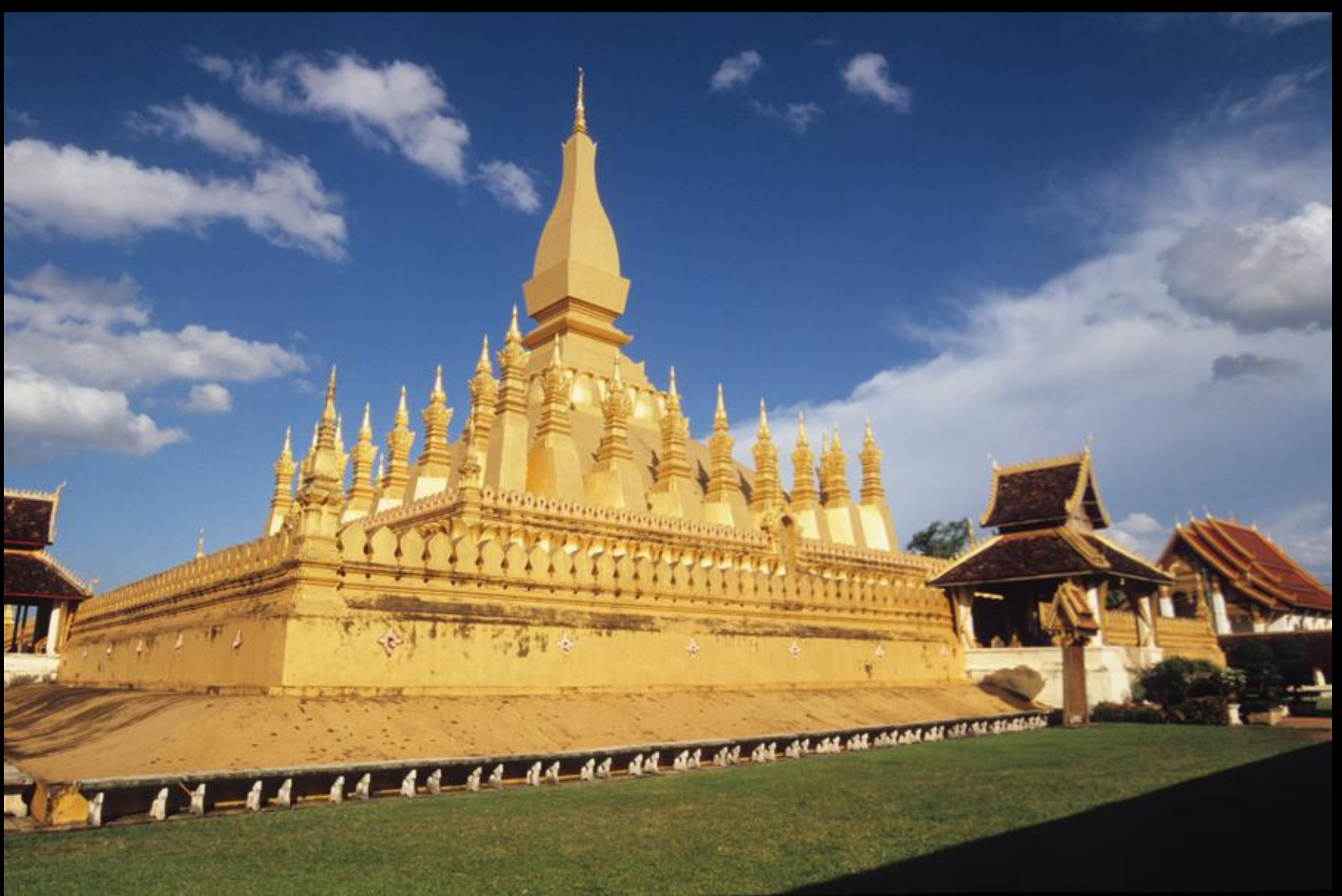
30 The grand Vat That Luang, a National symbol of Laos. It was originally made in the 16th century and restored in the mid-20th century. Vientiane, Laos