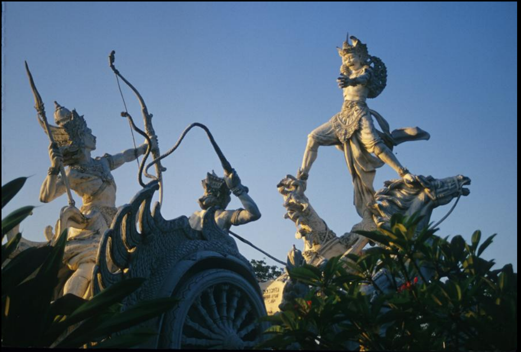
01 On the island of Bali in Indonesia, is this dramatic depiction of Bali, a great hero from the epic Ramayana.