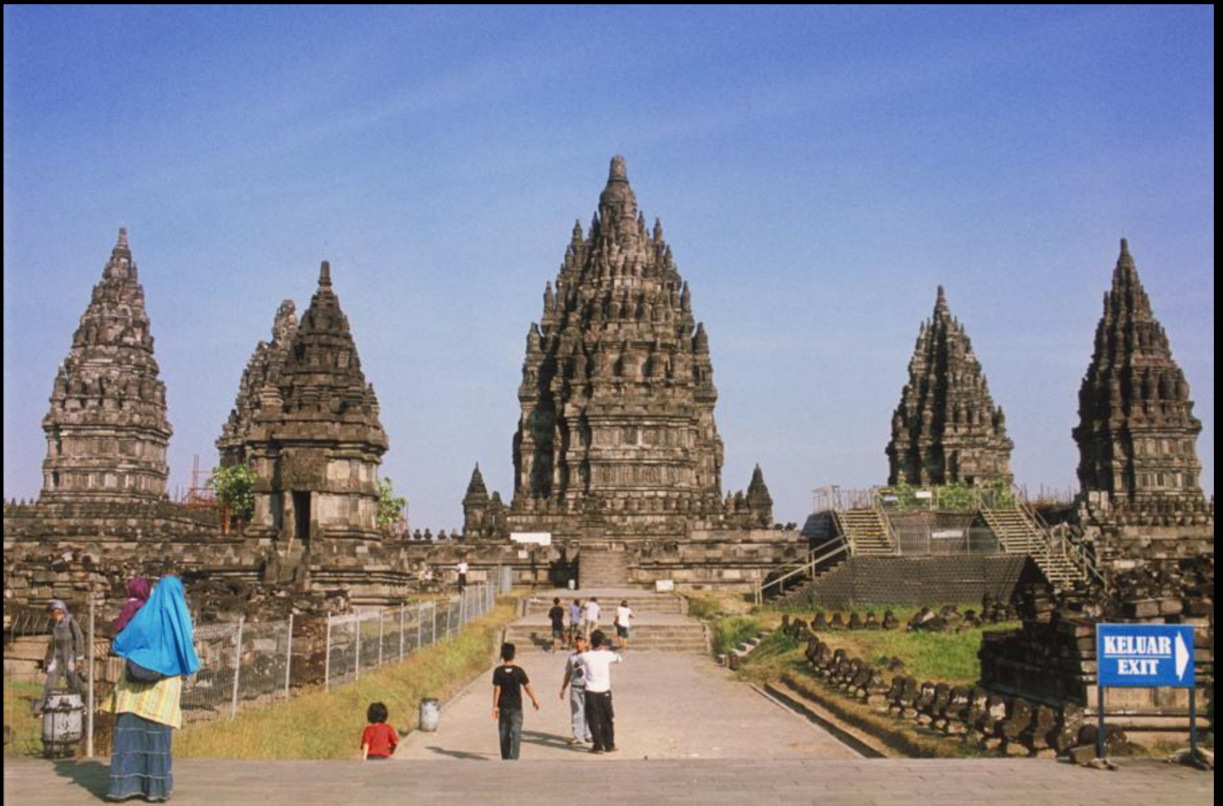
09 The Prambanan Shiva Temple, originally made in the 9th century, Yogyakarta, Java, Indonesia.