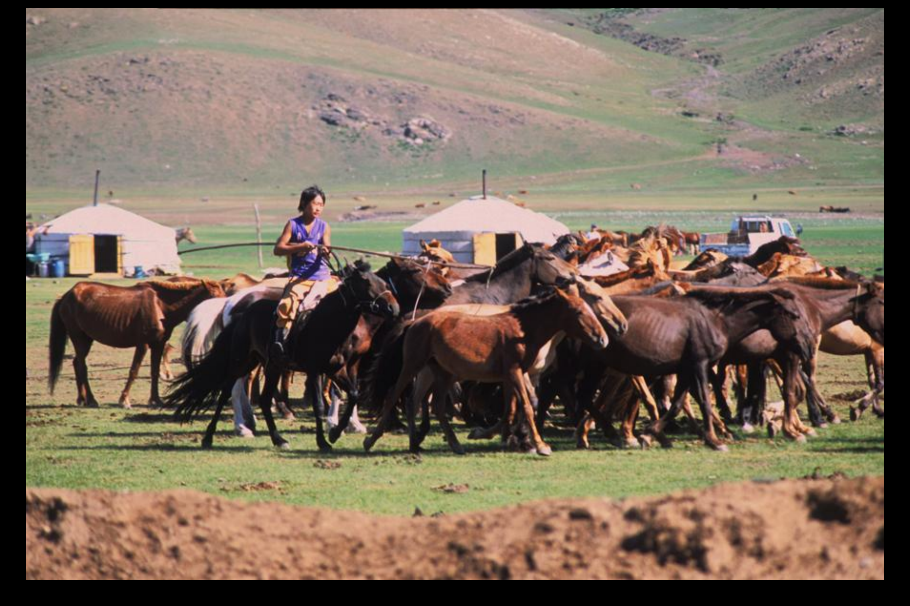
Nomads of Mongolia horses in Mongolia