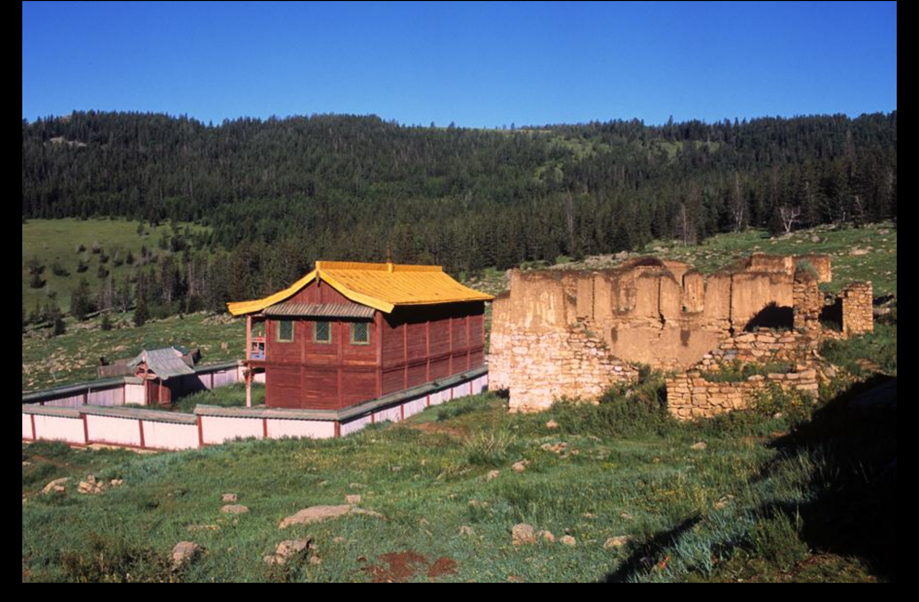
Manjushri Monastery, Mongolia