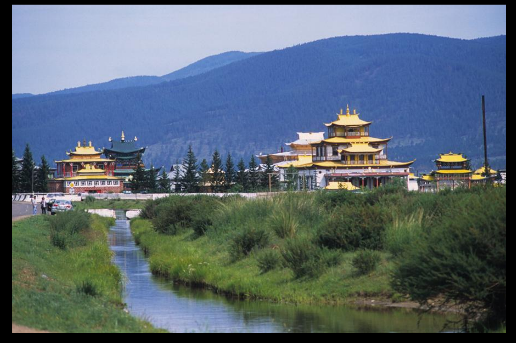
Ivolga Monastery, Buryatia