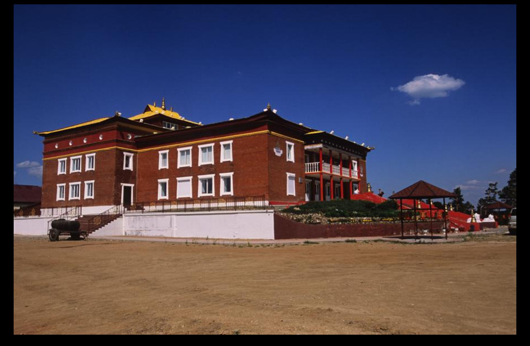
Buddhist monastery, Eshi Lodoi Rinpoche Temple