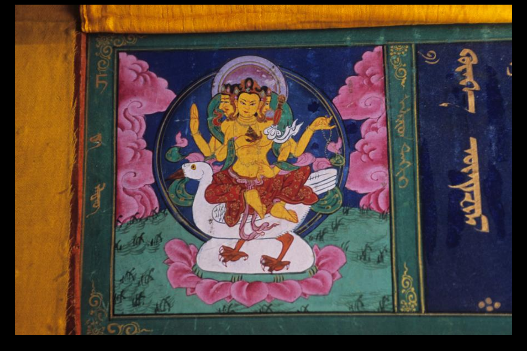
Brahma, painting in early Mongolian Buddhist manuscript, Buryatia Ms. collection.