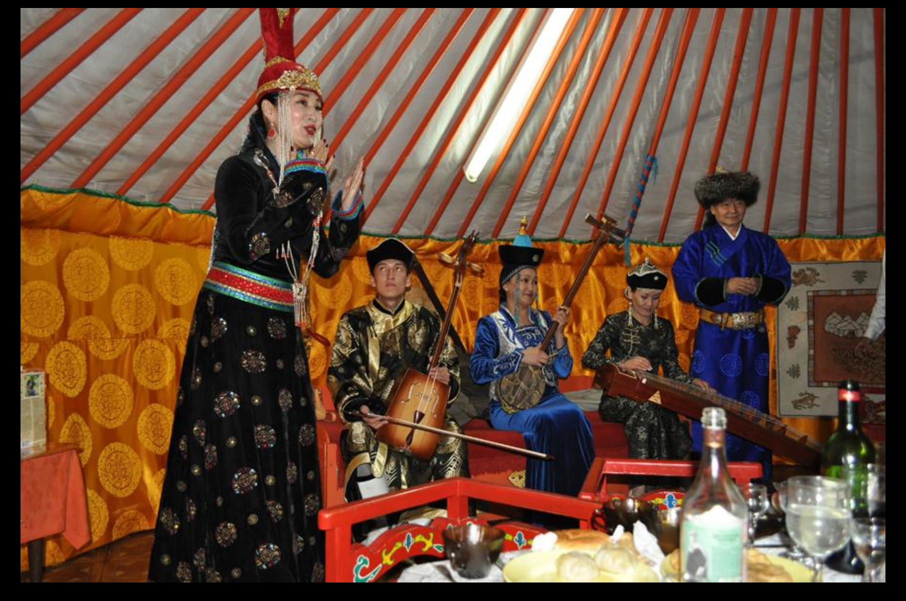
Traditional Buryatia musicians