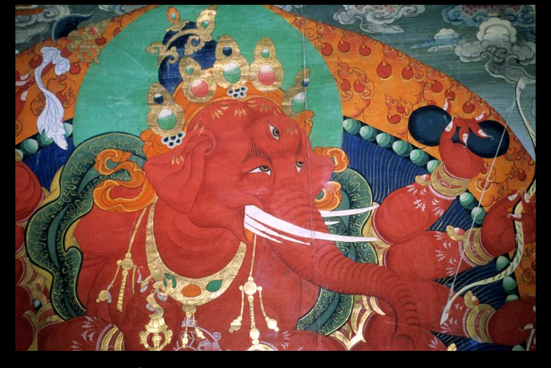
Three-eyed Ganesa, Tangkha, Khuree style, Late 19th cent., Bogd Khan Palace Museum, Ulaanbaatar, Mongolia