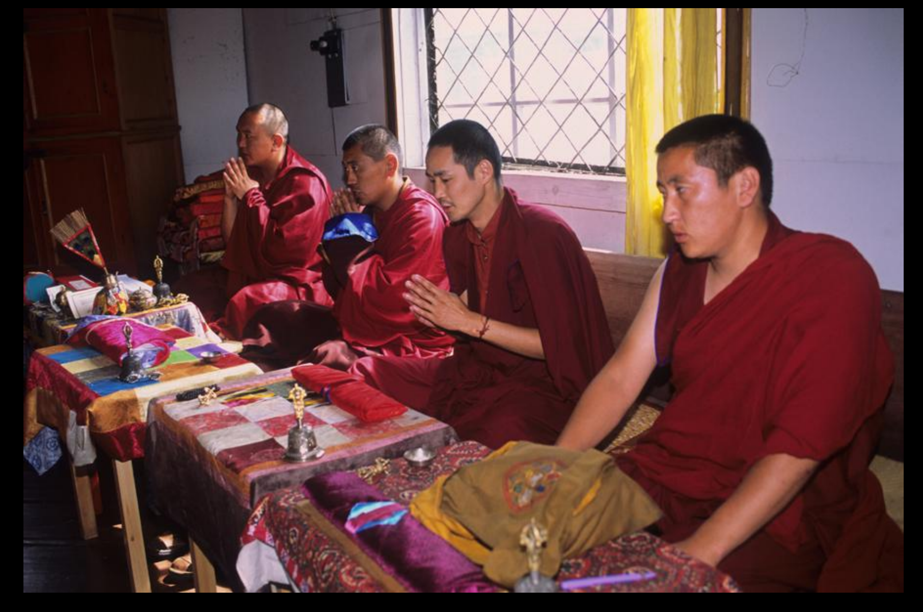
Lamas in Ivolga Monastery, Buryatia