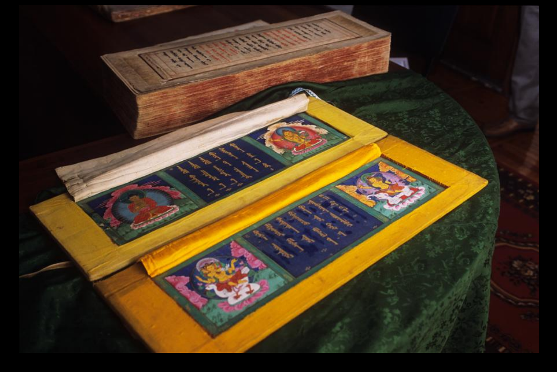
Mongolian Ganjur, sacred Buddhist texts, 18th cent., Ulan Ude, Buryatia Ms. collection.