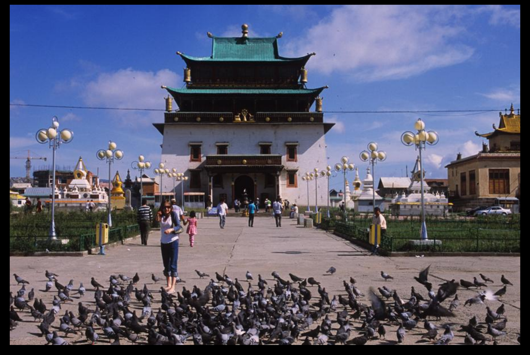
10 Gandan Monastery, Ulaanbaatar, Mongolia