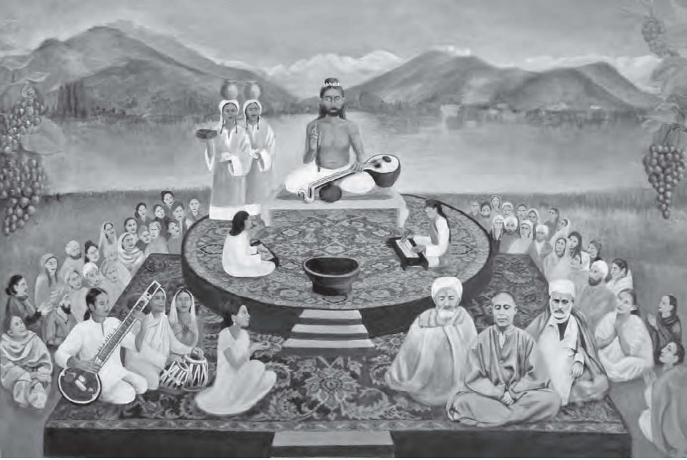
Abhinavagupta in Assembly