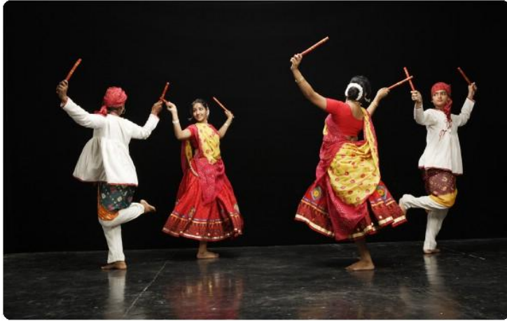
Fig 4: Dandiya Raas performed by men during Navratri.