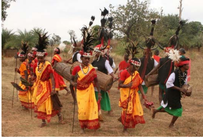
Fig 2: A dance of the Bison-Horn Maria Gonds of Chhattisgarh. The men wear horned head-dresses with plumes while the women hold the dancing sticks.

We can, therefore, conjecture that the two warriors spearing each other on this Kalibangan seal are performing the Saila dance with spears during the Dussehra festival, while the woman dressed up as a tiger symbolizes the tiger-riding goddess Danteshwari. Interestingly, she is wearing a horned head-dress with a leafy branch in the center, which is still worn by the Bison-Horn Maria Gonds of Chhattisgarh during their dances.