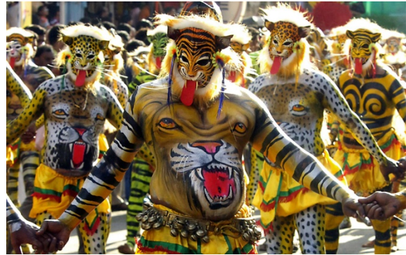
Fig 9: Puli Kali dance performed in Kerala during Onam festival.

Therefore, we can infer that the Indus Valley tradition of performing martial dances with spears in honor of the tiger-goddess has been preserved within the tribal and folk cultures of India. Some of these practices are no longer observed within mainstream Hinduism, which has undergone many modifications over the course of the past 3000 years, due to the emergence of indigenous philosophies, artistic and literary forms, and the influence of external cultures. But the tribal groups, many of who migrated into India following the collapse of the Indus Valley civilization, have been able to preserve certain elements of the ancient Indus heritage, due to their habitats in remote forested tracts, outside the reach of homogenizing influences.