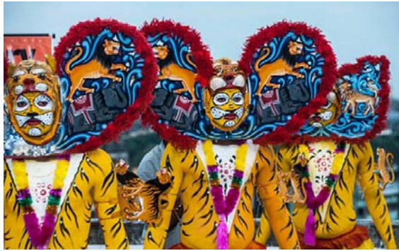
Fig 8: Bagh Nritya performers from Orissa.

Similar dances are called Puli Attam in Tamil Nadu, Puli Vesham in Andhra Pradesh, Huli Vesha in Karnataka, and Puli Kali in Kerala. Most of these dances are performed during and around the time of Dussehra .