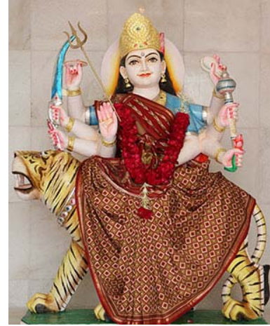
Fig 5: Amba Mata riding a tiger.

The image on the Kalibangan seal can, therefore, also be interpreted as the performance of the Dandiya Raas with spears in honor of the tiger-riding goddess Amba Mata, during the Navratri festival.