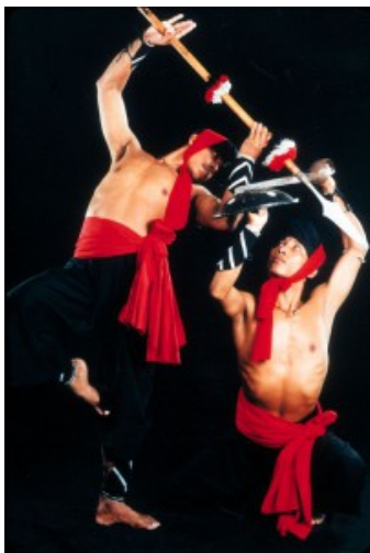
Fig 6: Thang-ta performance with spear and sword.

Martial dances with spears and swords are practiced by tribal cultures of India, and are particularly popular among the hilly tribes of the Northeast. For instance, the traditional martial art dance of Manipur is called Thang ta – the art of the sword and spear. The tribes of Nagaland usually wield weapons such as the spear and the sword, and wear colourful costumes and elaborate plumed head-dresses, during their dances.