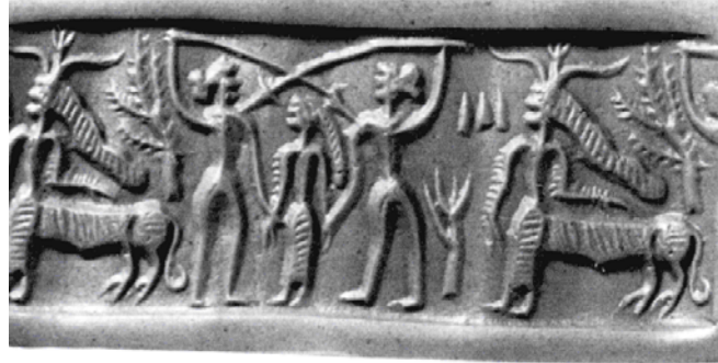
Fig 1: The Impression of Kalibangan cylinder seal K-65 shows two warriors spearing each other, and holding the hand of a lady, while a woman dressed as a tiger stands nearby.

The Kalibangan cylinder seal K-65 has a complex imagery. An impression of the seal shows two men dressed as warriors (since they are wearing their hair in a divided bun at the back of the head) spearing each other. They are holding the hand of a lady who is wearing a long head-scarf, bangles in one arm, and a long skirt. Behind them is a woman partially dressed as a tiger , wearing a horned headdress with a leafy branch, head-scarf, bangles, and a long skirt.