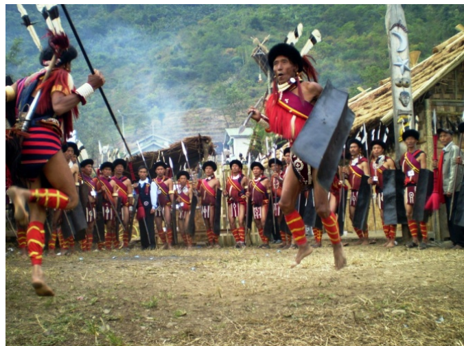
Fig 7: Naga dancers with spears during the Horbill Festival.

Nor do the tribal folk shy away from dressing up as animals during their dances. In Orissa, a popular tribal dance form is the Tiger Dance (Bagh Nritya) which is dedicated to the tiger-goddess Durga. For