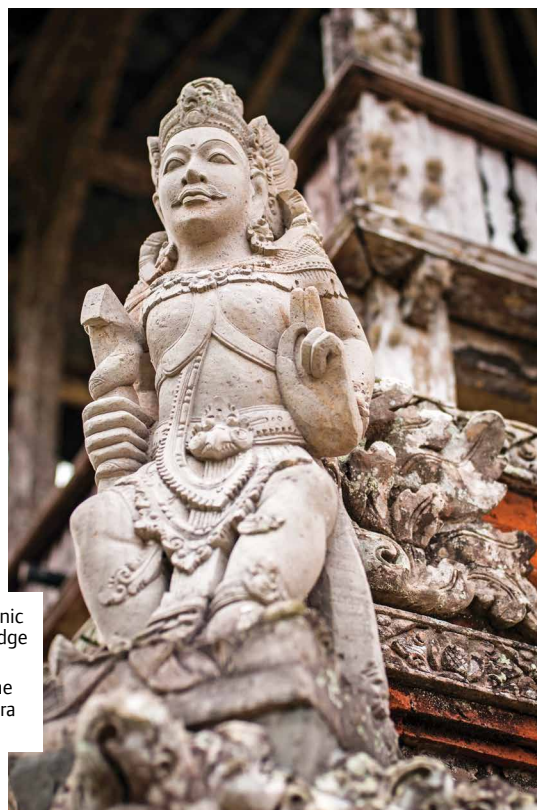
Right: A stone figurine at Pura Taman Ayun.