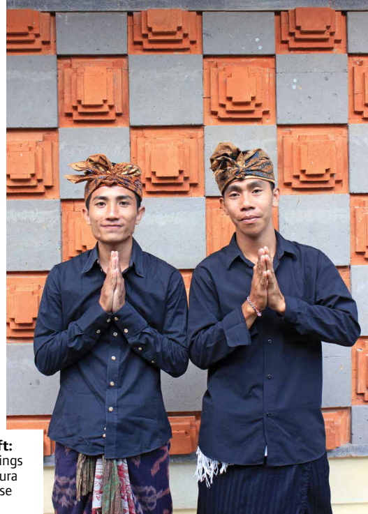
Clockwise from left: Beautiful stone carvings adorn the walls of Pura Desa Batuan; Balinese boys at Taman Ayun temple; The Pura Gunung Lebah overlooks the confluence where Sage Markandeya meditated.