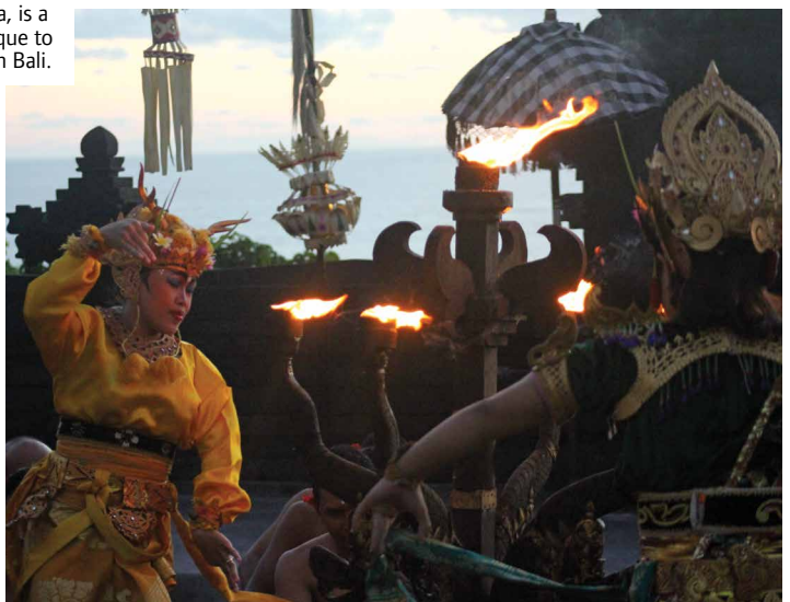
M&CTherm-Weise / age fotostock / Dinodia; Anurag Mallick