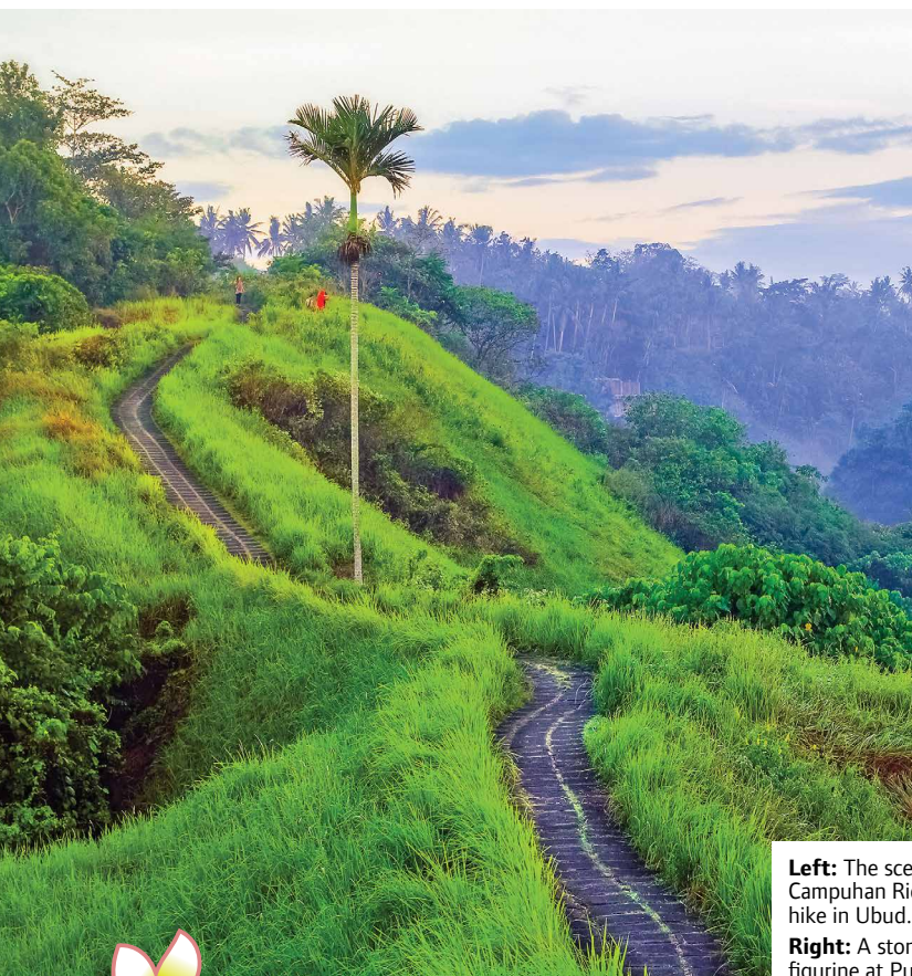
Left: The scenic Campuhan Ridge hike in Ubud.