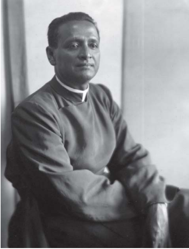
Swami Nikhilananda (1895–1973)

Then comes the third stage. Yatra supto na kanchana kamam kamayate na kanchana svapnam pashyati tat sushuptam . That is called sushupti , which means deep sleep, when the sleeper does not desire any objects. There is no desire for food in sleep. There is no desire at all in sleep. And one does not see any dreams. The third quarter or the sushupti state is called Prajna, whose sphere is deep sleep; the Self as Prajna. Vaishvanara, Taijasa, and Prajna—three names are given, one for each state. The Atman manifesting in the waking state is Vaishvanara. The Atman manifesting as the dream Self is called Taijasa. The Atman manifesting in the sleep state is called Prajna. In sleep, that is, in the Prajna manifestation of the Self, all experiences become unified and undifferentiated, who is verily a mass of consciousness intact.