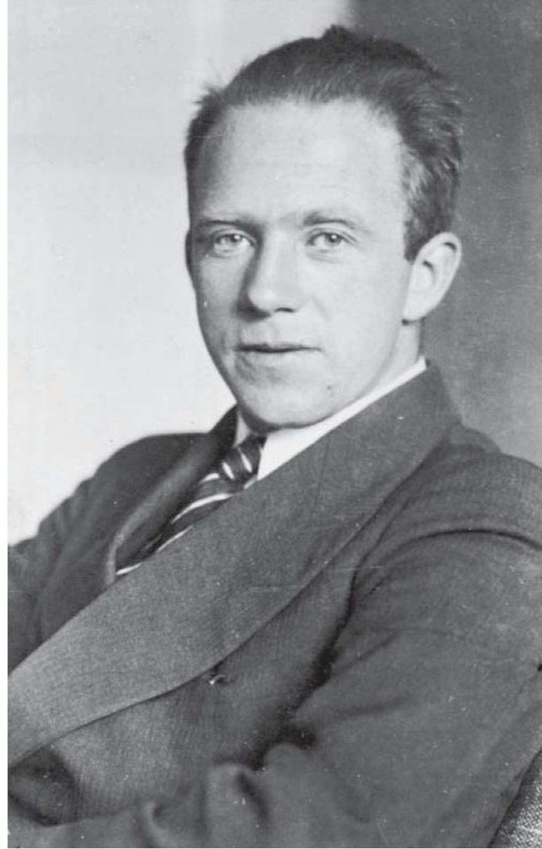
Werner Karl Heisenberg (1901–76)

Brahman is sat , pure existence. Now we will see what is the fourth pada . ‘That which is designated as Prājña (when it is viewed as the cause of the phenomenal world) will be described as Turīya separately when it is not viewed as the cause’ (31). When causality is taken away, then this Prajna itself is Turiya . When causality functions, there is the cause of the waking and the dream, it turns back to Prajna and the like. ‘The causal condition is also verily experienced in this body from such cognition of the man who is awakened from the deep sleep’ (32). What did he say: ‘I did not know anything at the time of