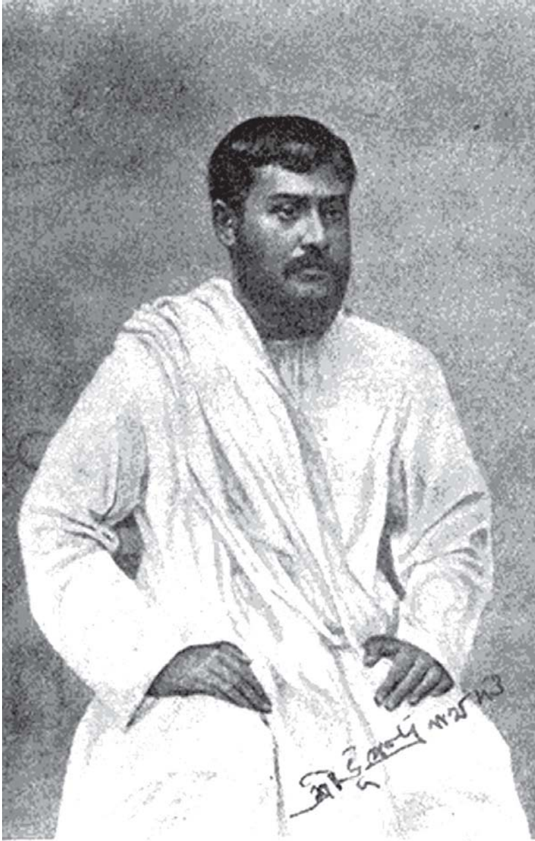
Bhupendranath Datta (1880–1961)